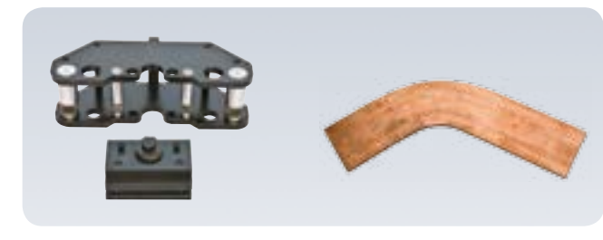
Vertical Bending Moulds Vertical Bending Sample