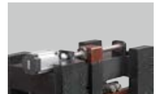
Moving Cylinder Device