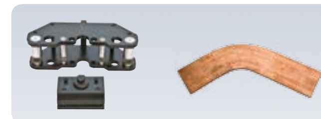
Vertical Bending Moulds Vertical Bending Sample