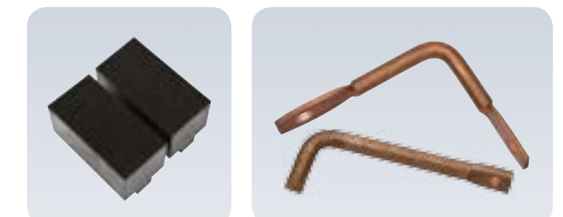
Embossing Moulds Copper Bars Squash Sample