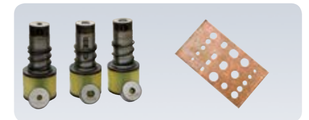
Punching Moulds Punching Sample