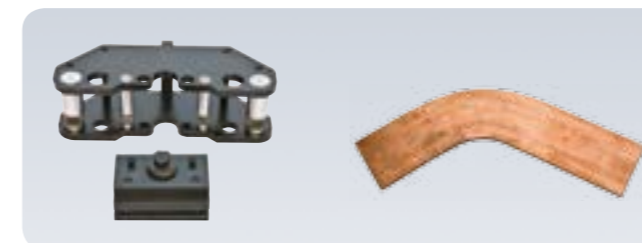
Vertical Bending Moulds Vertical Bending Sample