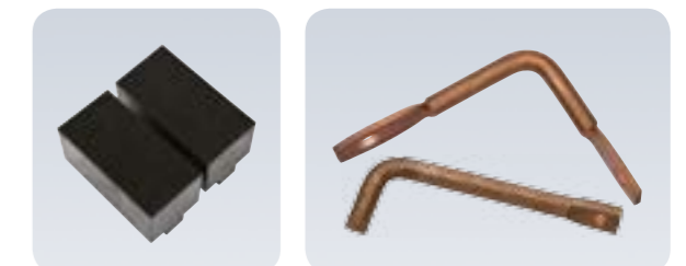
Embossing Moulds Copper Bars Squash Sample